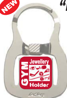
Item # 1000 - White Nickel

• Available branded with your choice of jewellery-related safety message for sports, workplace, dance schools, etc. • • Emblème Porte-Bijoux ci-bas disponible imprimé en Français •