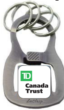
Item # 2500 - Brushed Nickel

• Brand Awareness • Contact Information • Milestones • Anniversaries • Gift With Purchase • Commemorative •